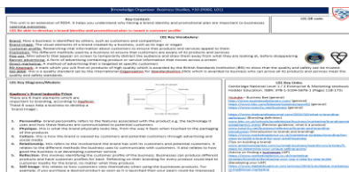
Knowledge Organiser Y11 R066 - L01